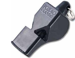
Region Championships this week.

That being said, we are beginning to open the opportunity to officiate at the Badger