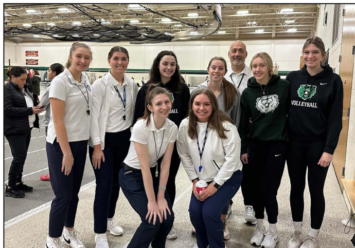
New officials were trained last week at the University of Wisconsin-Parkside.